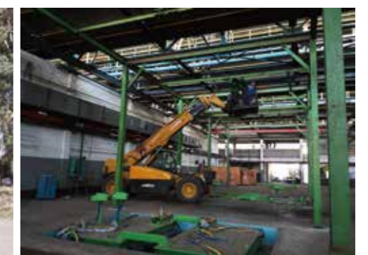
XCMG Telescopic Handlers Build Sugar Refinery in Ethiopia