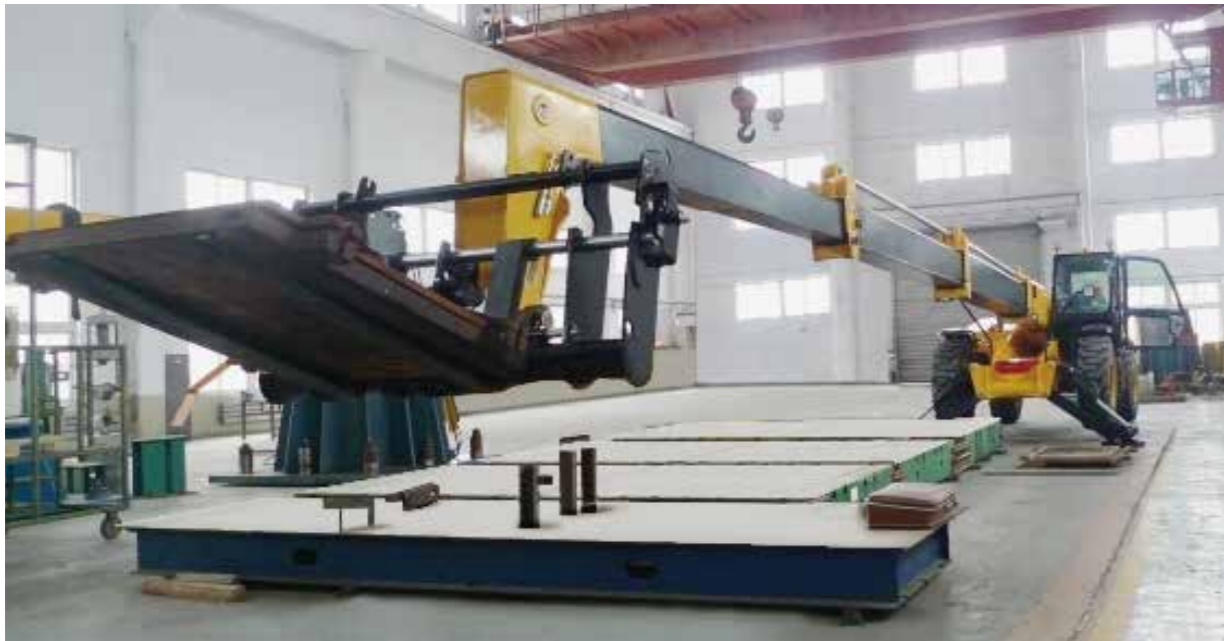
Has passed fatigue load and overload tests of 200,000 times