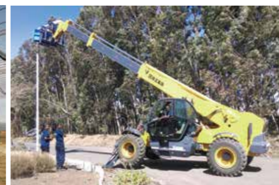
XCMG telescopic handlers help municipal constructions in Africa