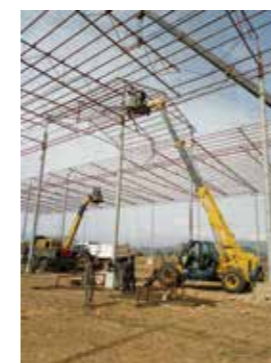
XCMG Telescopic Handlers Build Steel Structures Overseas