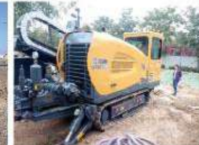
XZ360E水平定向钻机在河南郑州施工 XZ360E HDD works in Zhengzhou City, Henan Province

随着技术进步产品将不断改进，样本的技术信息与实物可能存在差异 实际产品的供货状态应以销售合同为准，样本仅供参考 如果想获取相关产品的最新信息，请您保持与我们的及时联系