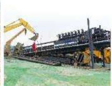
XZ13600河北唐山曹妃甸双龙河穿越工程施工 XZ13600 HDD is working to get through Caofieldian Shuanglong River in Tangshan City