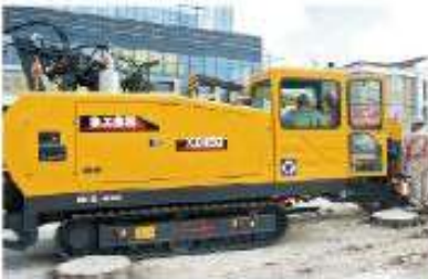
XZ450水平定向钻机在上海施工 XZ450 HDD working in Shanghai