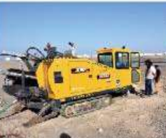
XZ200水平定向钻机在阿曼施工 XZ200 HDD working in Oman