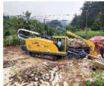
XZ960E江西管道项目施工 XZ960E HDD is working for the pipeline project in Jiangxi Province