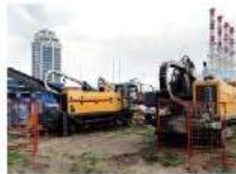
XZ680A水平定向钻机在俄罗斯施工 XZ680A HDD working in Russia