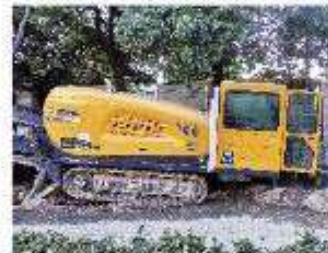
XZ420E水平定向钻机泰州电力管道项目施工 XZ420E HDD is working for the electricity pipeline project in Taizhou City