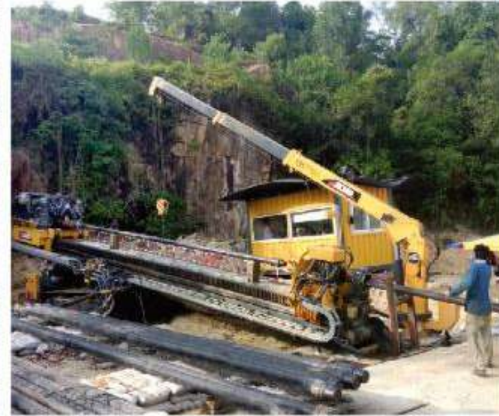
XZ5000在马来西亚穿越卢穆特海湾 XZ5000 works to get through Lumut Bay in Malaysia