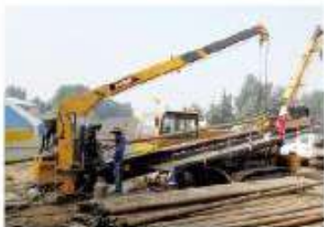
XZ3600水平定向钻机在山东泰安施工 XZ3600 HDD working in Ta'an Shandong