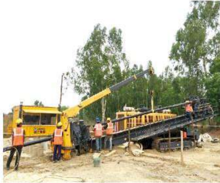
XZ3000在印度坎布尔穿越恒河2.2公里 XZ3000 HDD works to get through Ganga River by 2.2Km Kanpur