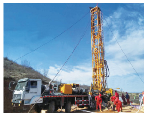
XSC8/400深井钻机山西煤层气井施工 XSC8/400 Deep Well Drilling Rig in CBM Well Construction in Shanxi