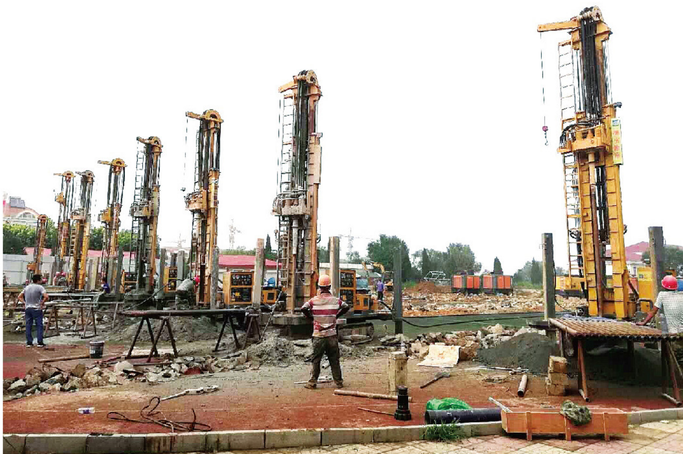
XSL4/200水井钻机北戴河地热井施工 XSL4/200 Water Well Drilling Rig in Geothermal Well Construction in Beidaihe