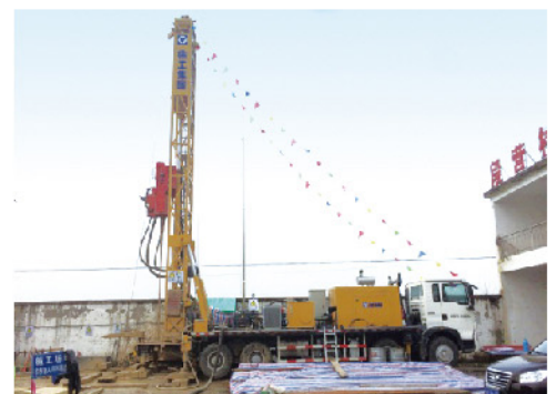
XSC5/260水井钻机亳州水文监测井施工 XSC5/260 Water Well Drilling Rig in Hydrological Monitoring Well Construction in Bozhou