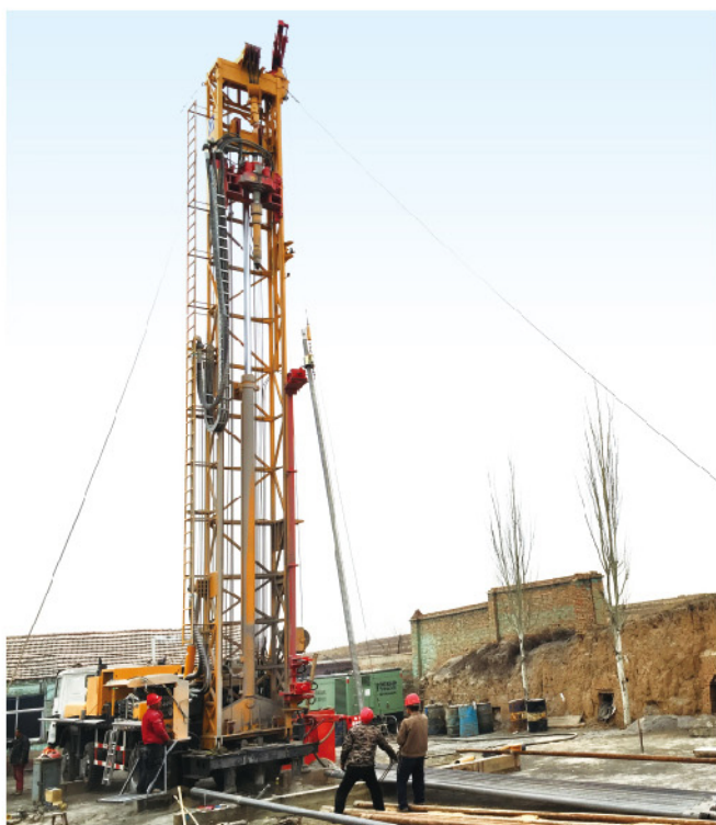
XSC8/400深井钻机山西水井施工 XSC8/400 Deep Well Drilling Rig in Water Well Construction in Shanxi