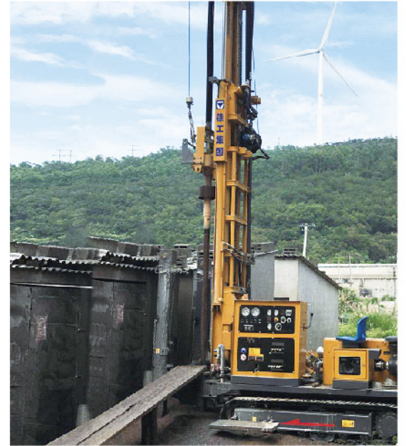
XSL4/200水井钻机福建饮用水井施工 XSL4/200 Water Well Drilling Rig in Water Well Construction in Fujian