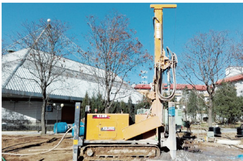
XSL5/260水井钻机北京地热井施工 XSL5/260 Water Well Drilling Rig in Geothermal Well Construction in Beijing