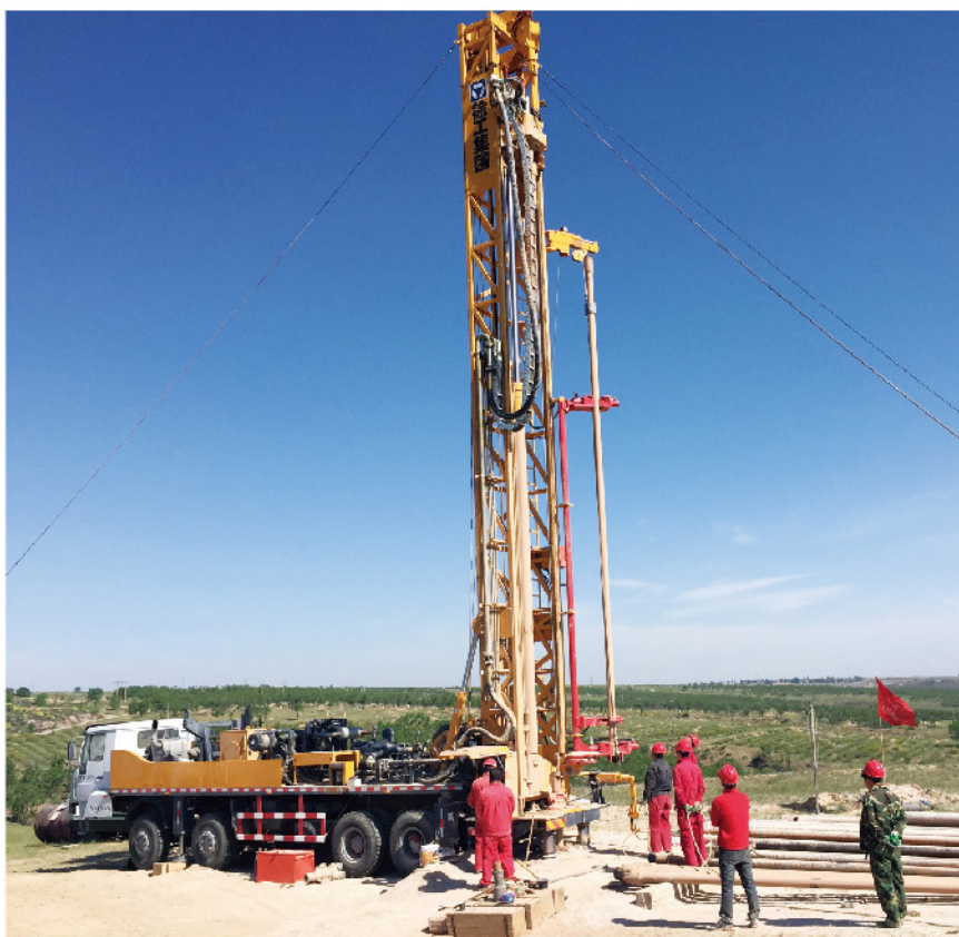
XSC8/400深井钻机山西煤矿巷道探水施工 XSC8/400 Deep Well Drilling Rig in Water-probing in Mine Construction in Shanxi