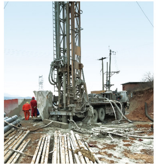
XSC8/400深井钻机山西煤层气井施工 XSC8/400 Deep Well Drilling Rig in CBM Well Construction in Shanxi