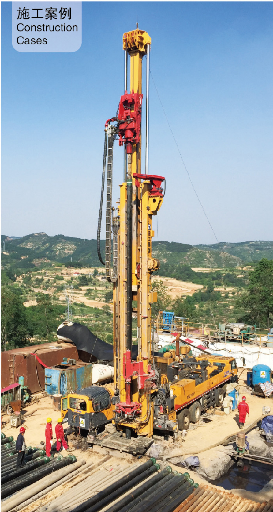
XSC20/1000深井钻机山西煤层气井施工 XSC20/1000 Deep Well Drilling Rig in CBM Well Construction in Shanxi