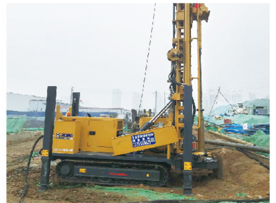
XSL7/350水井钻机山东钢管桩施工 XSL7/350 Water Well Drilling Rig in Steel Pipe Pile in Shandong