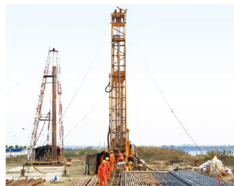
XSC8/400深井钻机盐城水文监测井施工 XSC8/400 Deep Well Drilling Rig in Hydrological Monitoring Well Construction in Yancheng