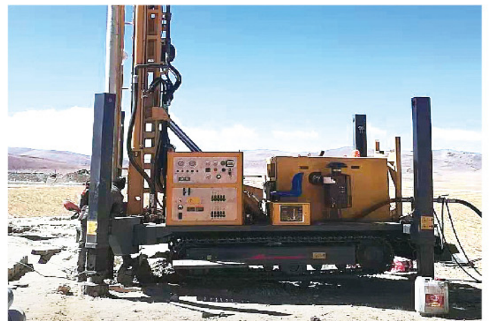
XSL7/350水井钻机西藏灌溉井施工 XSL7/350 Water Well Drilling Rig in Irrigation Well Construction in Tibet