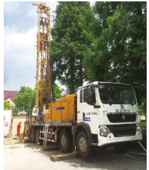
XSC5/260水井钻机上海战备井施工（电动机） XSC5/260 Water Well Drilling Rig in Readiness Well Construction in Shanghai (Electromotor)