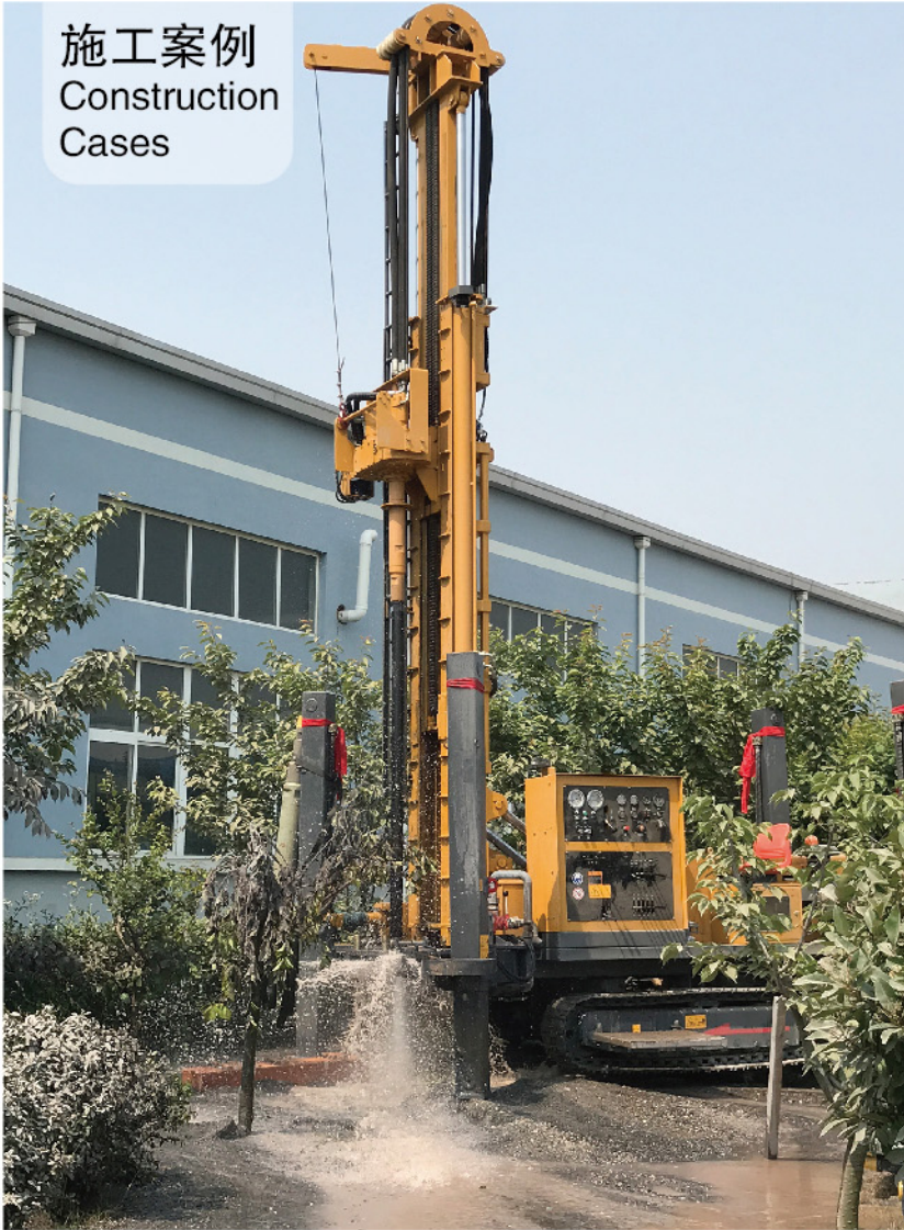
XSL4/200水井钻机山东灌溉井施工 XSL4/200 Water Well Drilling Rig in Irrigation Well Construction in Shandong