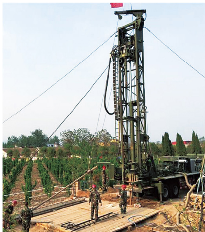
XSC8/400深井钻机河南水井施工 XSC8/400 Deep Well Drilling Rig in Water Well Construction in Henan