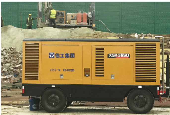
XSK36SD空压机山东施工 XSK36SD Air Compressor is working in Shandong Province